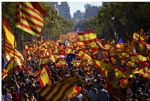
Manifestación "Unionista" en Barcelona convocada por la Sociedad Civil Catalana (SCC) en Octubre de 2019